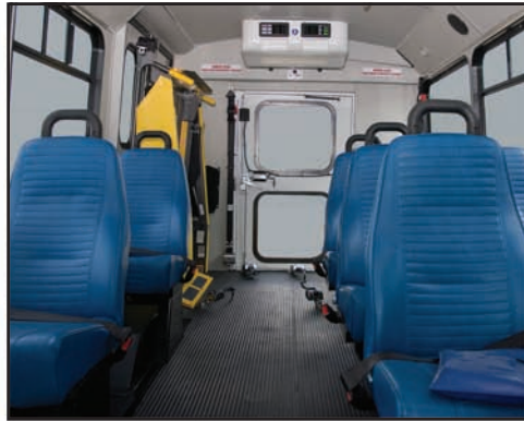
ADA packages available.