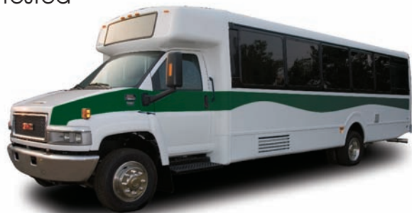
Several lengths of General Motors chassis also available.